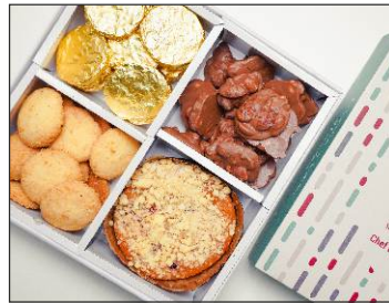
Gift hamper 2 1000/-