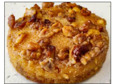
Honey Walnut & raisins

125 gms 250 gms 500 gms 1kg 300 - 450 - 800 - 1600