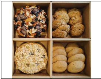
Gift hamper 5 900/-