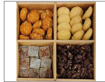
Gift hamper 3 800/-