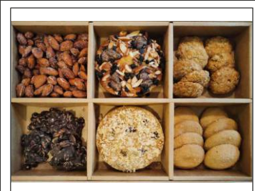
Gift hamper 12 1850/-