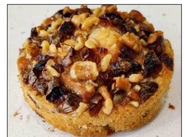
Dry fruit delight (Raisin, almond, prunes, apricot)

125 gms 250 gms 500 gms 1kg 300 - 450 - 800 - 1600