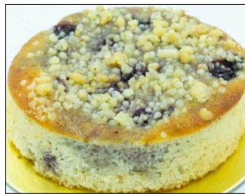
Mixed berry crumble

125 gms 250 gms 500 gms 1kg 300 - 450 - 800 - 1600