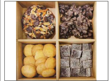
Gift hamper 8 1100/-