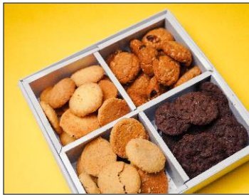
Gift hamper 1 650/-