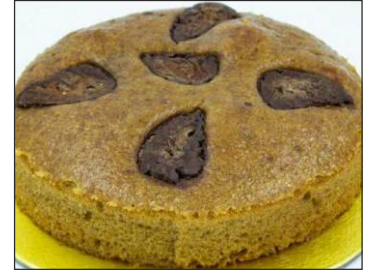
Dark chocolate espresso

125 gms 250 gms 500 gms 1kg 300 - 450 - 800 - 1600