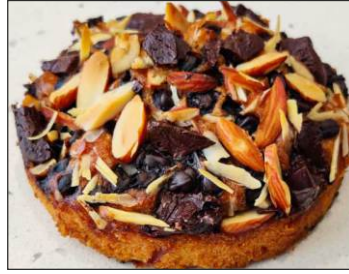
Roasted almonds & chocolate chunks

125 gms 250 gms 500 gms 1kg 200 - 300 - 600 - 1200