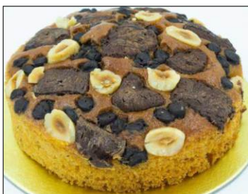
Chocolate & roasted hazelnuts

125 gms 250 gms 500 gms 1kg 300 - 450 - 800 - 1600