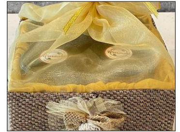
Gift hamper 13 2000/-