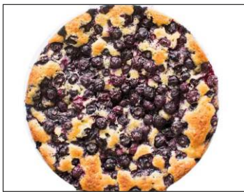
Vanilla & blueberry

125 gms 250 gms 500 gms 1kg 300 - 450 - 800 - 1600