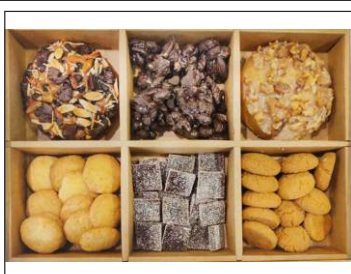
Gift hamper 10 1650/-