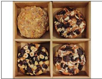
Gift hamper 6 1100/-