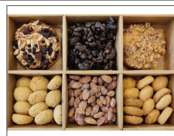
Gift hamper 11 1850/-