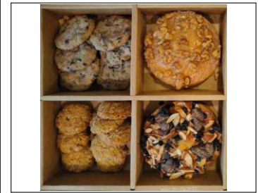
Gift hamper 4 900/-