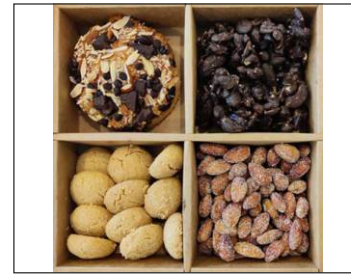
Gift hamper 7 1250/-