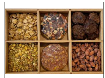
Gift hamper 19 1500/-