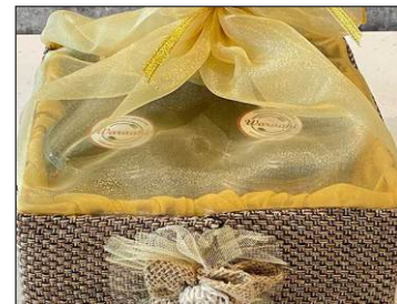
Gift hamper 17 1100/-