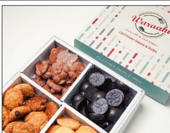
Gift hamper 9 900/-