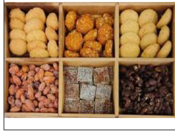
Gift hamper 14 1700/-