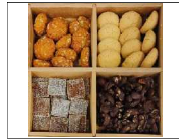
Gift hamper 3 750/-