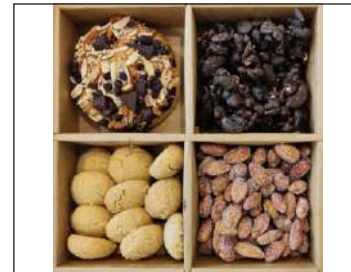
Gift hamper 7 1200/-