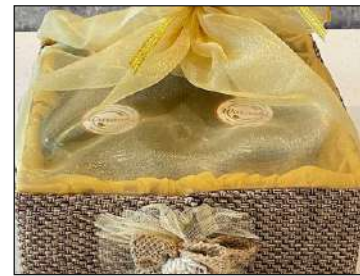
Gift hamper 18 1900/-