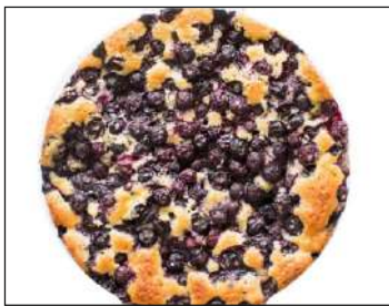
Vanilla & blueberry