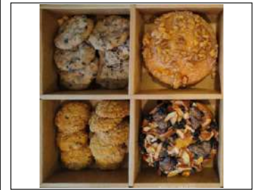
Gift hamper 4 850/-