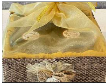
Gift hamper 17 1100/-