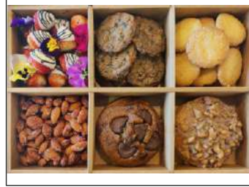
Gift hamper 15 1800/-