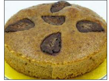
Dark chocolate espresso