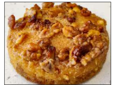
Honey Walnut & raisins