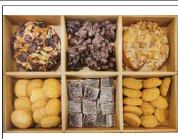
Gift hamper 10 1600/-