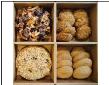
Gift hamper 5 850/-