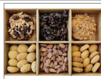
Gift hamper 11 1850/-