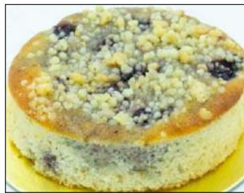
Mixed berry crumble