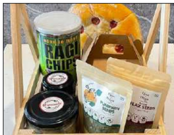
Gift hamper 19 1500/-