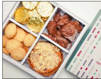
Gift hamper 2 950/-