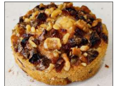
Dry fruit delight (Raisin, almond, prunes, apricot)