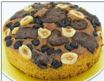
Chocolate & roasted hazelnuts