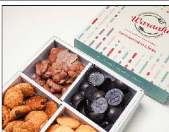
Gift hamper 9 850/-