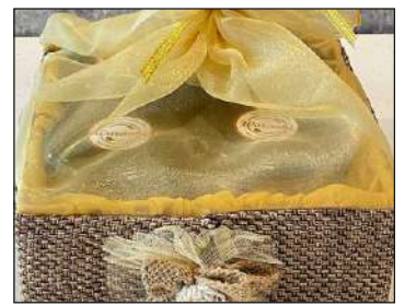
Gift hamper 16 900/-