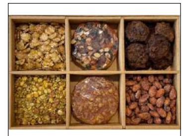
Gift hamper 21 1800/-