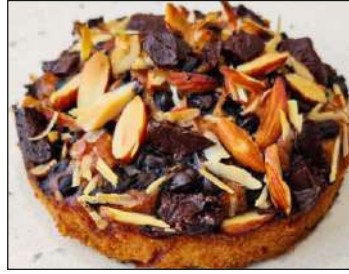
Roasted almonds & chocolate chunks