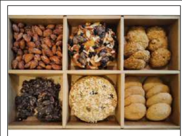
Gift hamper 12 1850/-