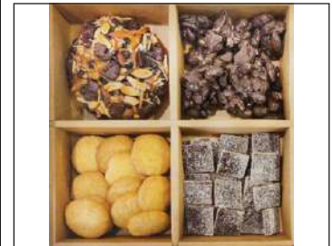
Gift hamper 8 1050/-