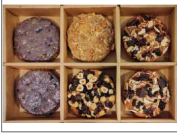
Gift hamper 13 2000/-