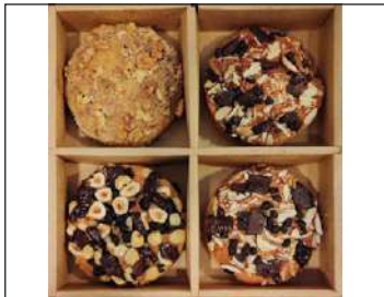
Gift hamper 6 1100/-