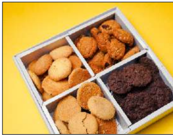
Gift hamper 1 600/-