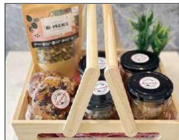
Gift hamper 20 1900/-